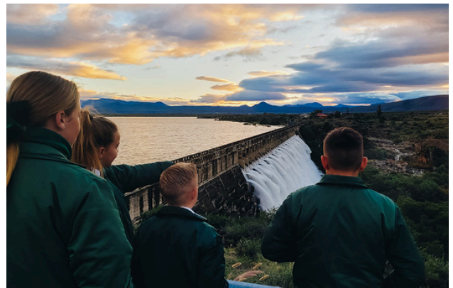
TO UNION HIGH SCHOOL LEARNERS SOAKING IN THE BREATHTAKING MORNING VIEW OF THE NQWEBA DAM OVERFLOWING BEFORE SCHOOL EARLIER THIS YEAR. ONE OF THE MANY PERKS OF LIVING AND GOING TO SCHOOL IN GRAAFF-REINET - SPECTACULAR SCENERY RIGHT AT YOUR DOORSTEP!

Yes, those were the days that will always be remembered.